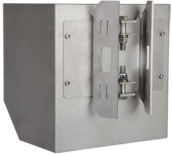
Rear DEV 7152

The Intelligent Optribution® Outdoor Chassis DEV 7152 was designed to be installed close to an antenna and is intended for the optical transmission of the received RF signals. The outdoor chassis can be equipped with up to five optical modules, which provides possibilities for various applications: Either the chassis is equipped with five (basic, advanced or top performance) optical transmitter modules thus providing five optical links. Or the chassis is equipped with five twin optical transmitter modules thus providing ten optical links.