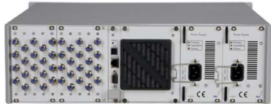
Rear DEV 7113