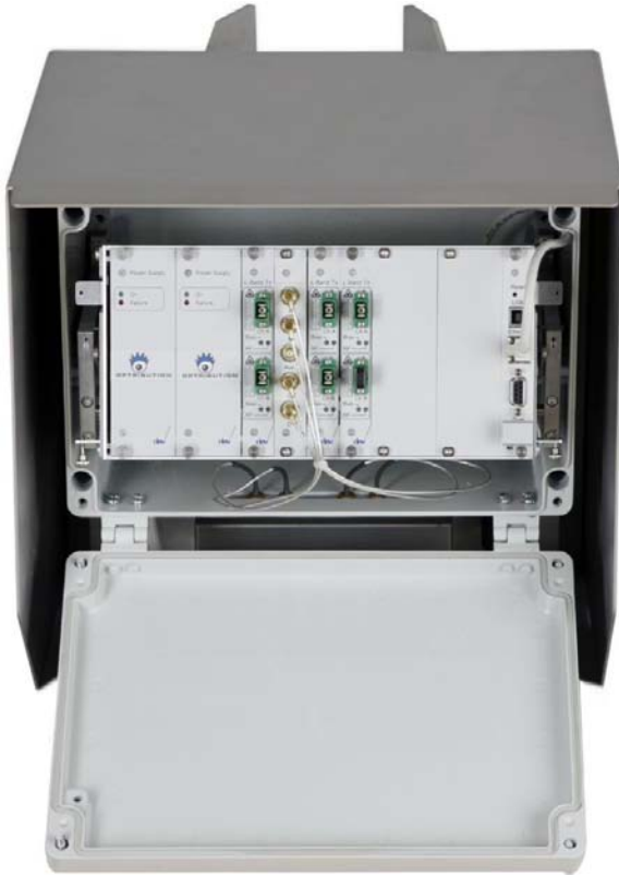
Front DEV 7152