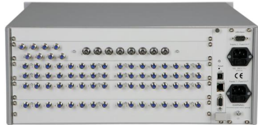
Rear DEV 7114