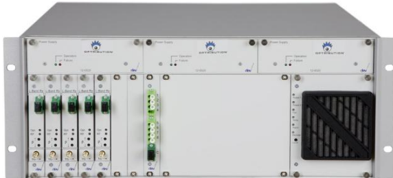
Front DEV 7114