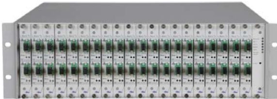
Front DEV 7113