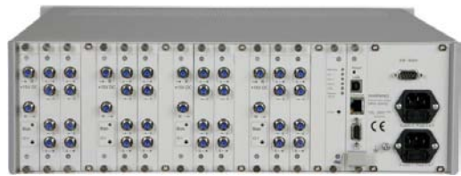
Rear DEV 1993/75/4*4+1