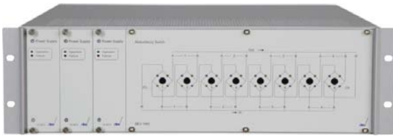
Front DEV 1993/zz/m*4+1